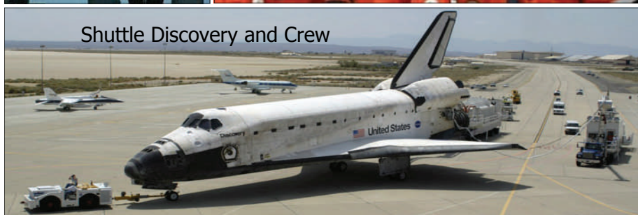
Shuttle Discovery and Crew