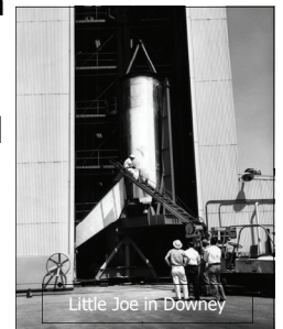
Little Joe in Downey